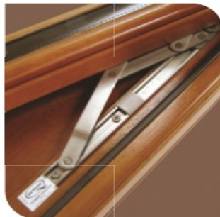
Modern austenitic stainless steel friction hinge