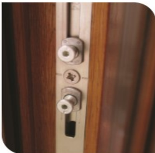
SBD approved twin-cam locking (TSL) espagnolette system