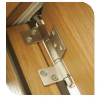
Secured By Design doors available including Bi-Fold