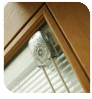
Integral Blinds available