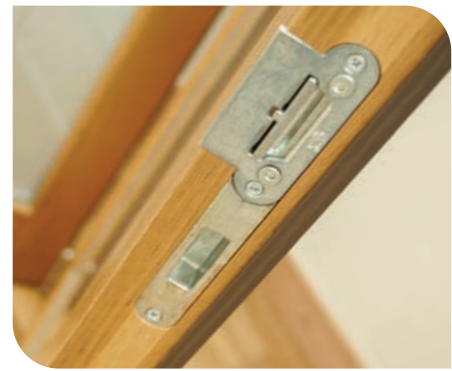
PAS 24:2012 Secured By Design multi-point locking